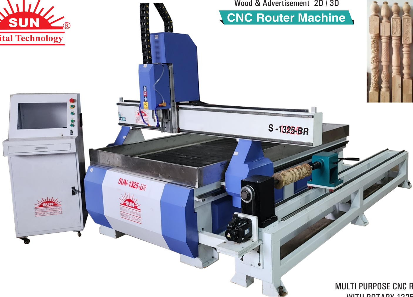
MULTI PURPOSE CNC ROUTER WITH ROTARY 1325-BR

This Machine Working on: Glass, Woods, MDF, ACP Sheet, Acrylic Sheet, Hardwood, PVC, Sheet, Korean Cutting, Optinal (2D & 3D Carving. Marble, Granite, Metal, Aluminium, Copper, Brass)